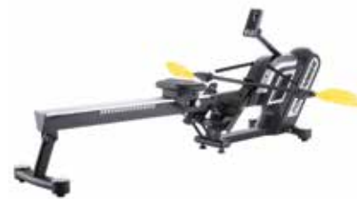
Yakapa multi-functional rower.

has long specialized in swimming goggles. It made waves in the water sports market in recent years with a modular system for swimming goggles with prescription lenses. Eradiate has now taken the concept on dry land, with a similar system for sports goggles,