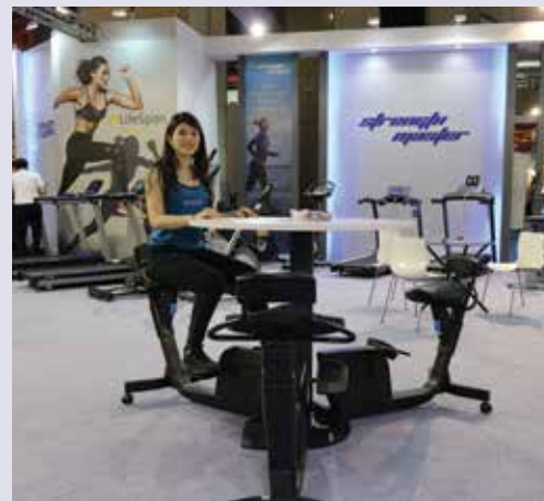
Multi-tasking is getting healthier with the Trio Desk.

The Taiwanese company’s development in the fitness market includes Ampera, a brand of training equipment with electronic torque, targeted at elite athletes. Strength Master displayed prototypes of an Ampera strength training machine and a rower at last year’s TaiSPO, but the technology has been updated. It has switched to an Android operating system and is launching an app to enhance Ampera with cloud-based tracking and virtual instruction. ■