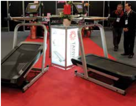
The 3-in-1 treadmill from JK Fitness for running, hiking and working.

The desk launched with the AeroDesk came with a flip-top design that increases safety by limiting the speed of the treadmill when the desktop is down. ■