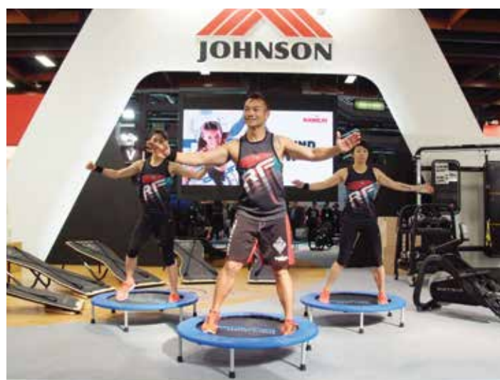
UBound is one of the most popular classes from Radical Fitness.

Radical Fitness offers ten classes in all, which are updated on a quarterly basis and accompanied by music produced in Argentina. Along with Fight Do and UBound they include classes for aerobics, dancing, indoor cycling and strength training, as well as the Raddkidz class for