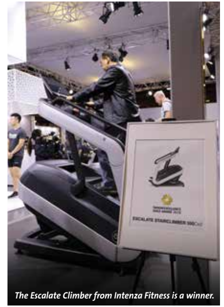
The Escalate Climber from Intenza Fitness is a winner.