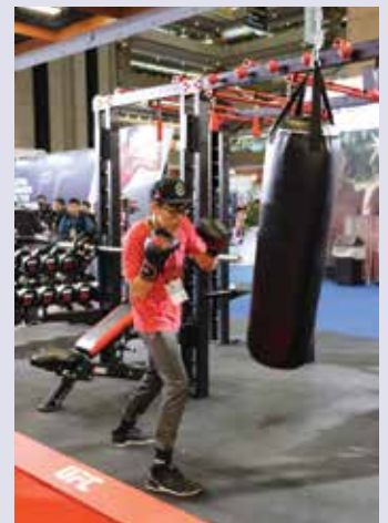
The UFC partnership should secure plenty of exposure for Dyaco.