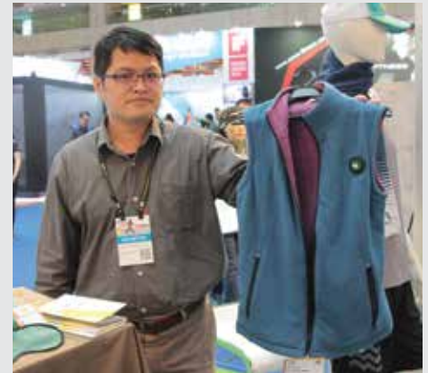
The heat is on at Everest Textile.

Everest is working on an even more advanced smart heating textile that automatically adjusts temperature based on the external conditions and the wearer's body temperature. ■