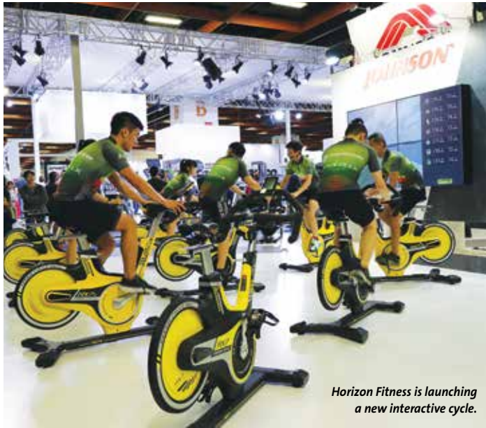
Horizon Fitness is launching a new interactive cycle.