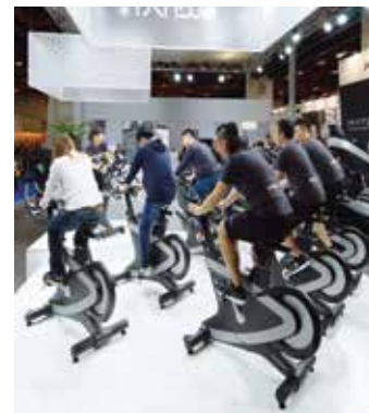
The Intenza group cycle 550GC is at the center of its demos.

is meant to function as a training center, as well as a showroom and a potential workshop space. “This offers an opportunity for our European customers,” she said. The customer-oriented facility was combined with the opening of a warehouse and distribution hub in Rotterdam, in the Netherlands.